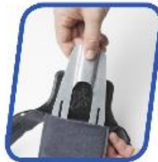
Telescopic aluminum upright for custom contouring