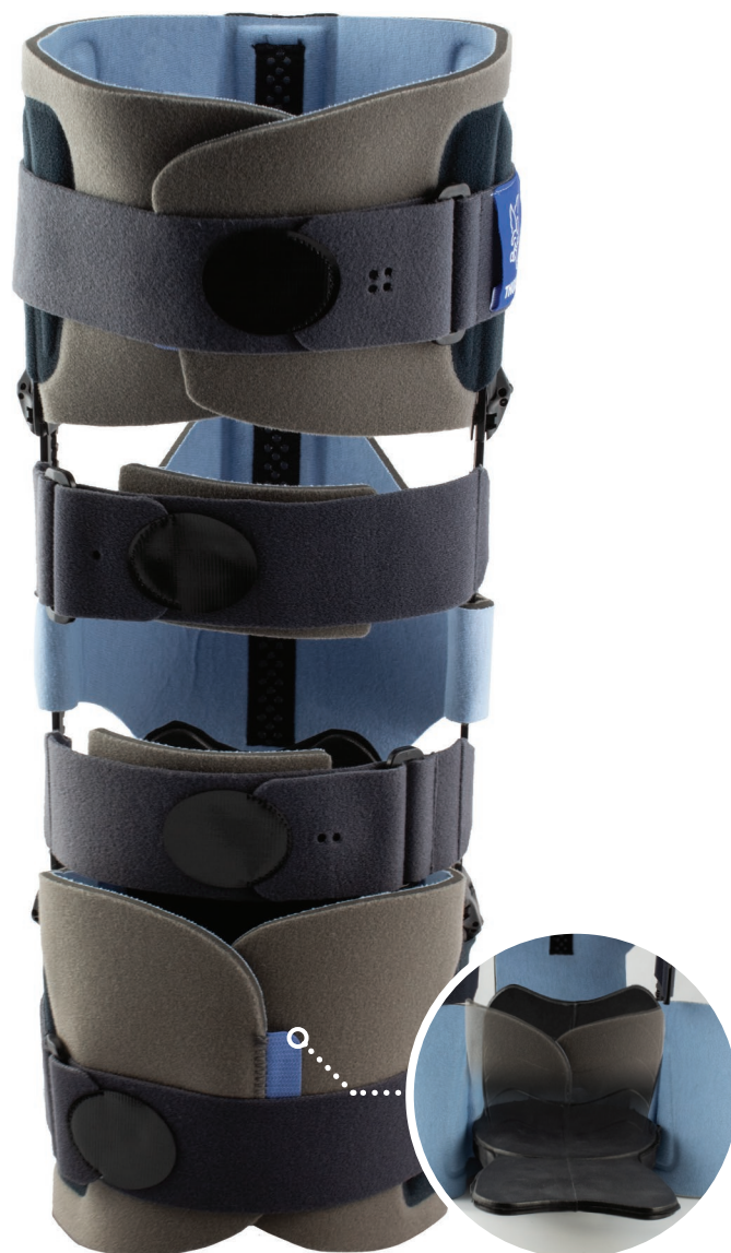
The residual limb is protected by a cushioned plate at the distal end of the brace